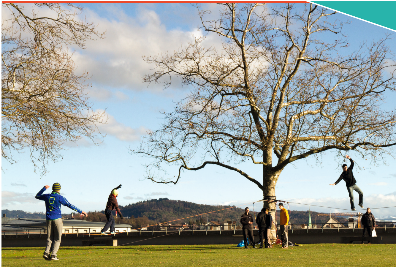
Fig. 2: While people are using the longlines, fellow slackliners keep an eye on the surroundings.