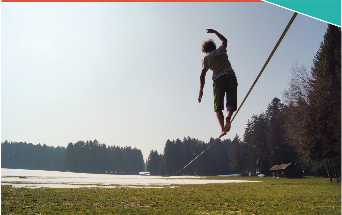
Fig. 4: Longer longlines (270 m in this case) are often not possible within urban areas.