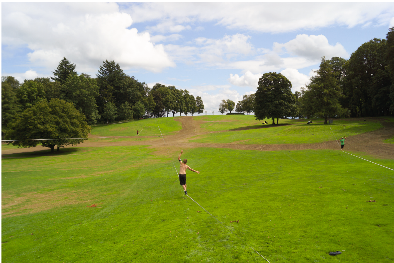
Fig. 8: You need to apply for a permit to be allowed to slackline in this park. The possible slacklines have been defined in cooperation with the owner of the park. A written agreement records the rights and duties of both, the owners and managers of the land as well as the slackliners.