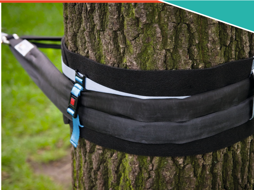
Fig. 6: A clean longline static-side anchor on a tree.