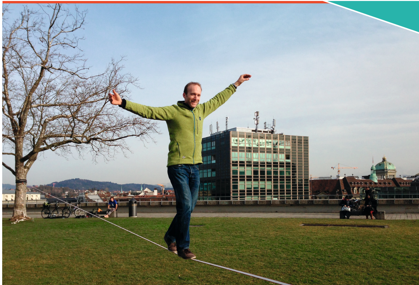
Fig. 1: Longlining in public parks requires considerable experience.