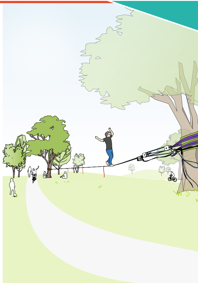
Fig. 3: Using high-visibility markers (red wind dampeners) on a longline is very important in public spaces.